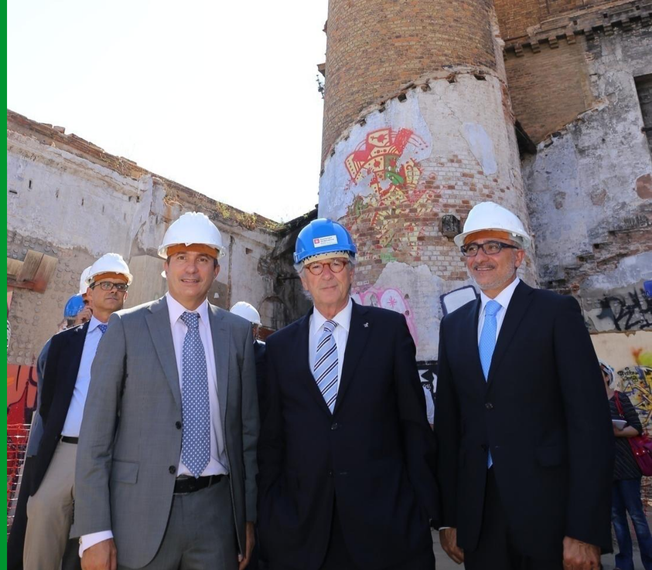
Smart City Center of Excellence kickoff at Smart Campus 22 @District July 22, 2014